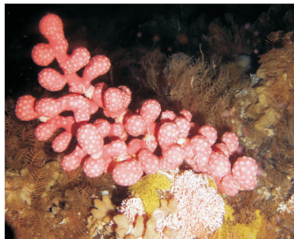
Figure 1. Example of coral habitat of the Aleutian Islands. Shown are the gorgonian coral Paragorgia arborea , unidentified hydrocorals, sponges, and hydroids.

Our review of the literature, museum records and our verified own collections indicate 86 different taxa (genera, species, or subspecies) of coldwater corals from the Aleutian Islands (Table 1) (see literature cited in Wing and Barnard, 2004). This is probably an overestimate because of the way some of the specimens have been classified. Specimens that were classified only to the genus level (e.g. Clavularia sp.) may be already listed species of the same genus or an undescribed species. More taxonomic work needs to be done on the specimens that have only been classified